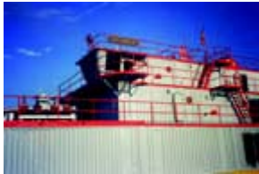
Photo 1 . Photograph of the Simulated Seagoing Vessel for live fire training.

Additional heat was provided by a liquid propane (LP) gas burner placed on a metal grating in the simulated engine room ( Figure 1 ). The metal grating had been heavily damaged by fire ( Photo 2 ). A large portable propane tank fed the propane burner whose lines were reported to be without a pressure regulator.